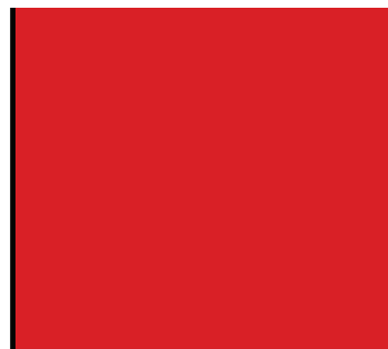
RED C=9 M=100 Y=100 K=1 PMS 186 #D71D24